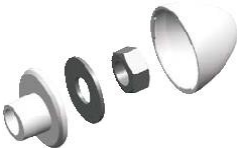
BUAK for suspended sanitary ware