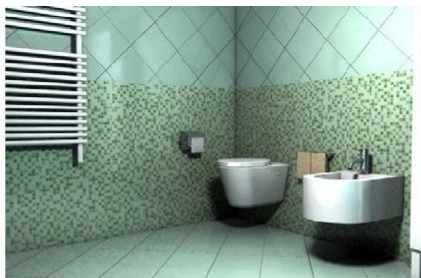
Suspended sanitary ware